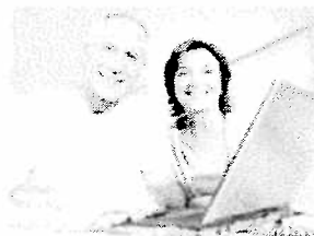
Checklist to Boost your Credit Score