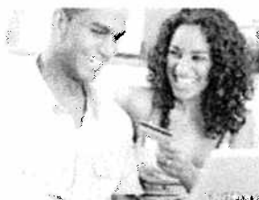
30 day Fix For the Bad Credit Blues